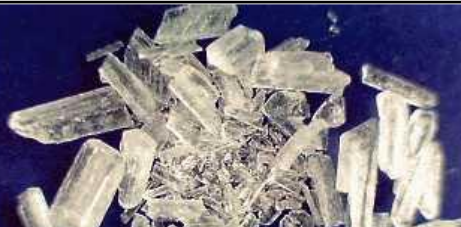
Stimulants Methamphetamine Amphetamine

*Use of cannabis in Japan, and the export of New Psychoactive Substance (NPS) from Japan are not prohibited by the current laws.